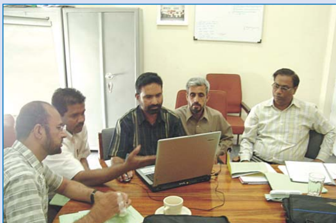
Group Exercise in Progress

Resource persons for the training course were drawn from Pakistan Institute of Development Economics (PIDE), Asian Development Bank (ADB), Micro Finance Network, Manpower Division Govt. of Pakistan, Small